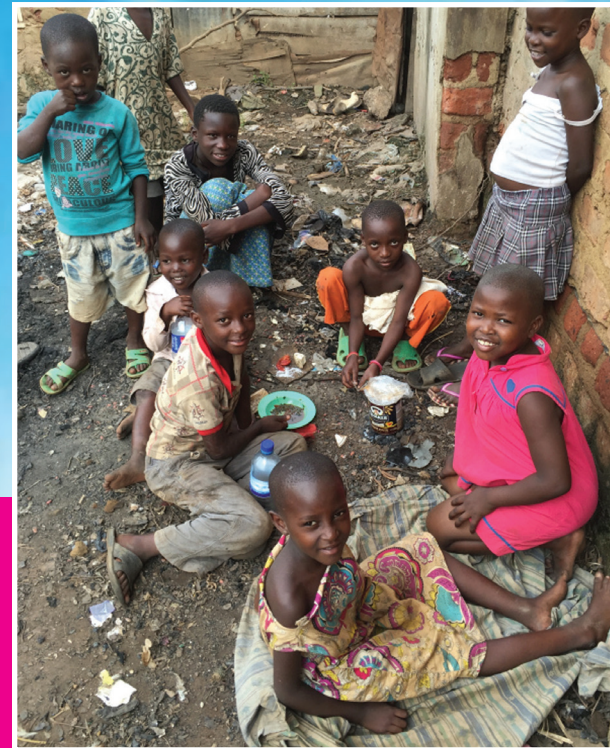
Abandoned children eating at garbage dump.

Tragically Asia has one of the largest sexual trafficking problems in the world. Many children are sold or kidnapped into slavery. For some there is hope after they are able to escape from captivity. However, the transition back to a normal child life is anything but easy. That's where ACF and our partners come in. Together we are helping to provide not only shelter and food for innocent victims, but also an education and therapeutic programs that can help them return to a normal life over time. With time, these children regain their joy and happiness, it's a transformation that is priceless .